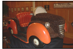
13. Clabber Girl