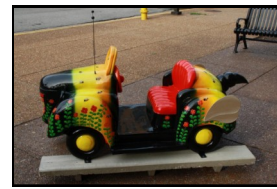
6. First Financial Bank