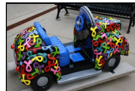
10 Union Hospital