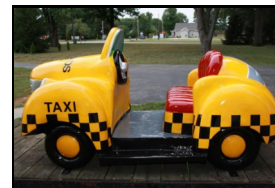
22. Morris Trucking