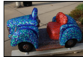
14. Thompson Thrift