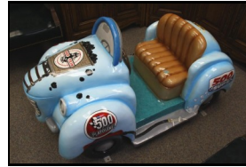
15. 500 Express