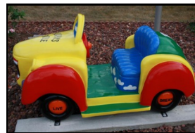
19. Williams & Associates