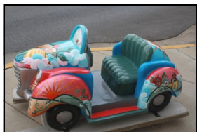
9. Wabash Valley Community Foundation