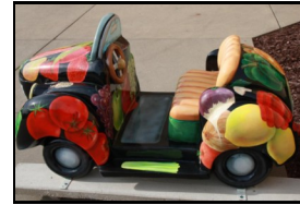
16. Baesler's Market