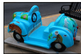
12. American Tile and Sales