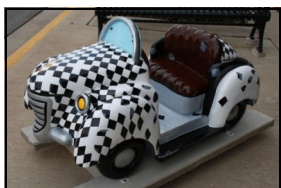
11. Sycamore Engineering