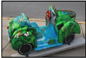
3. Morgan Stanley Smith Barney