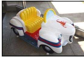
4. Hendrich Title Company