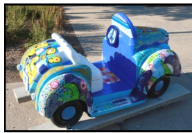
2. ISU Foundation