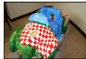
18. Riddell National Bank