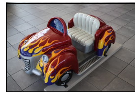
20. Dorsett Mitsubishi