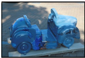
1. Indiana State University