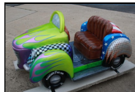
21. Terre Haute Prescription Shop