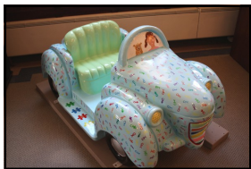
5. Terre Haute Savings Bank