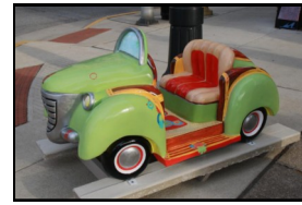
8. Crossroads Café, River Wools, ELB, Inc.