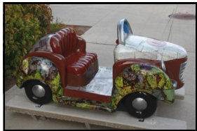
7. Swope Art Museum Boards