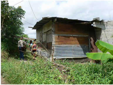
House, Panama City, Panama