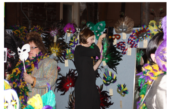
Partygoers shop for masks at the Swope's first Mardi Gras celebration!

Laissez les bon temps roulez! Chase away the winter blues with a warm and festive Mardi Gras at the Swope Art Museum. Your ticket entitles you to fun, festivities and frolicking on the third floor of the Swope Block. Enjoy a cash bar, delicious sweet and savory treats, complimentary masks, fun beads, games, fortune telling, photos and more. $25 for Swope or Art Hopper members/ $30 for non-members. Buy tickets in advance at the Swope, from any Swope Board Member or Art Hopper.