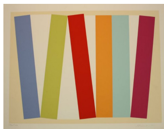
Charles Hinman (b. 1932), Composition, 1971, screenprint, gift of Paul Mann, 1973.105

On view March 5: reinstalled New Acquisitions On view May 7: reinstalled New Acquisitions